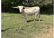
2A Playin For Keeps