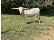
2A Playin For Keeps