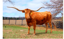
BL Coach's Desperado